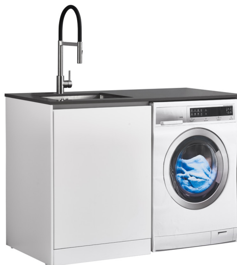
LEV13LDOCCMW (Matt White Cabinet)

Tapware, appliances, accessories and wastes not included, unless otherwise stated. Please note measurements are nominal only, please measure product on site. Actual colours may vary.