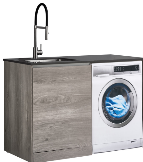
LEV13LDOCCEL (Elm Woodgrain Cabinet)