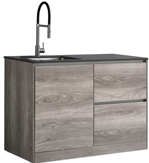
LEV13LDODRCCEL (Elm Woodgrain Cabinet)