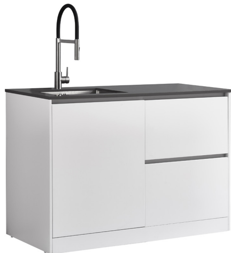
LEV13LDODRCCMW (Matt White Cabinet)

Tapware, appliances, accessories and wastes not included, unless otherwise stated. Please note measurements are nominal only, please measure product on site. Actual colours may vary.