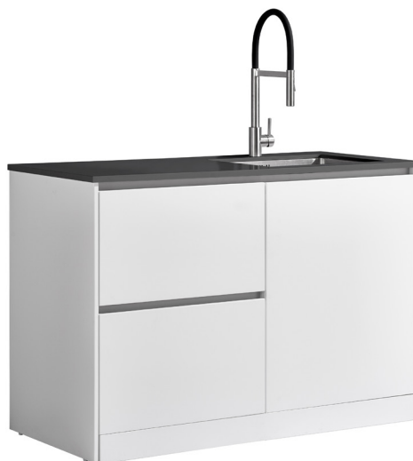
LEV13RDODRCCMW (Matt White Cabinet)

Tapware, appliances, accessories and wastes not included, unless otherwise stated. Please note measurements are nominal only, please measure product on site. Actual colours may vary.