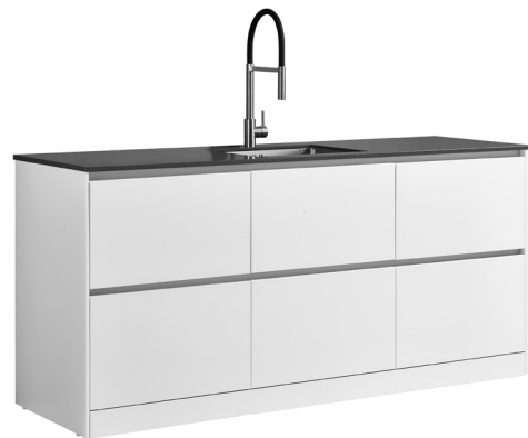
LEV19DRDRDRCCMW (Matt White Cabinet)

Tapware, appliances, accessories and wastes not included, unless otherwise stated. Please note measurements are nominal only, please measure product on site. Actual colours may vary.