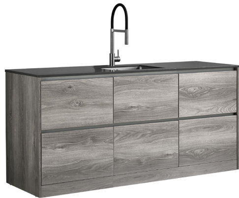
LEV19DRDRDRCCCEL (Elm Woodgrain Cabinet)