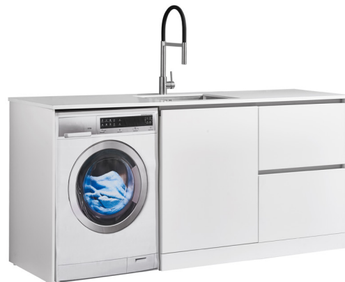
LEV19RDODRWHMW (Matt White Cabinet)

Tapware, appliances, accessories and wastes not included, unless otherwise stated. Please note measurements are nominal only, please measure product on site. Actual colours may vary.