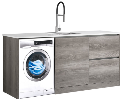
LEV19RDODRWHEL (Elm Woodgrain Cabinet)