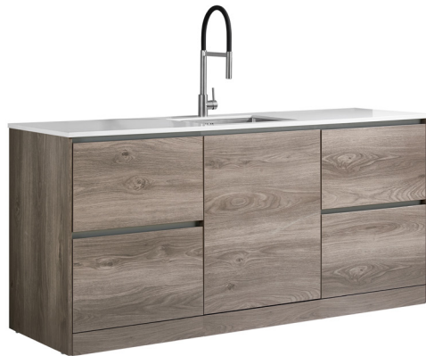
LEV19DRDODRWHEL (Elm Woodgrain Cabinet)