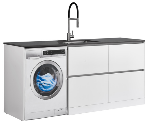
LEV19RDRDRCCMW (Matt White Cabinet)

Tapware, appliances, accessories and wastes not included, unless otherwise stated. Please note measurements are nominal only, please measure product on site. Actual colours may vary.